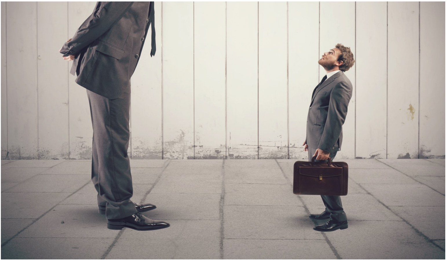
Breaking Barriers to God; Building Bridges to one another; Blessing Others by serving.